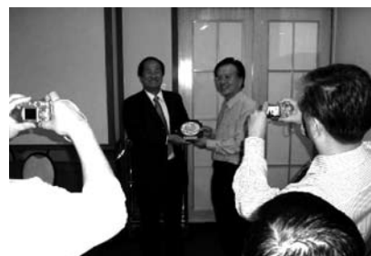
Figure 10. Interaction with members of the Malaysia-China Chamber of Commerce.