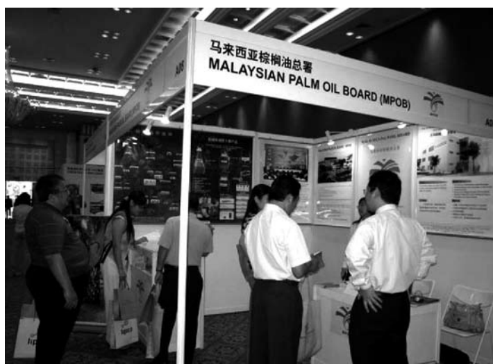
Figure 12. Oils & Fats International (OFI) China 2007, September 2007, Guangzhou.

• APEC Biofuels Summit, Qingdao. A paper, Biofuel Development Programme in Malaysia was presented at the APEC Biofuels Sum-