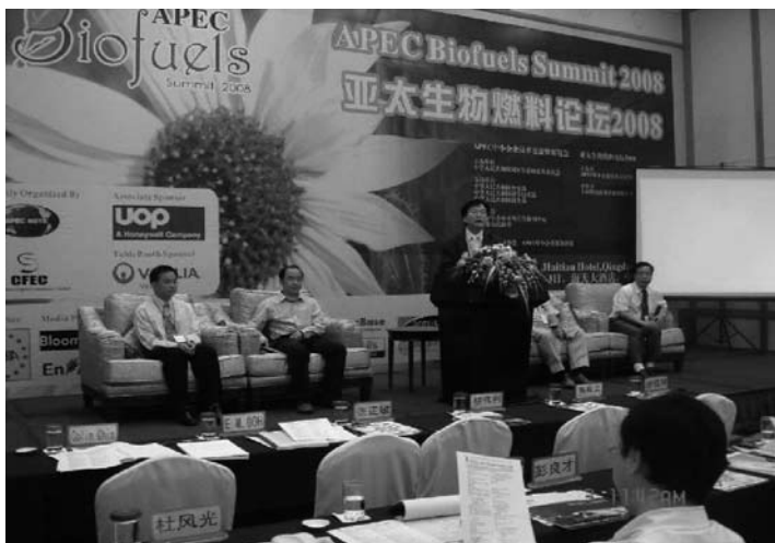
Figure 14. APEC Biofuels Summit, June 2008, Qingdao.

mit, Qingdao, China from 1-3 June 2008 (Figure 14).