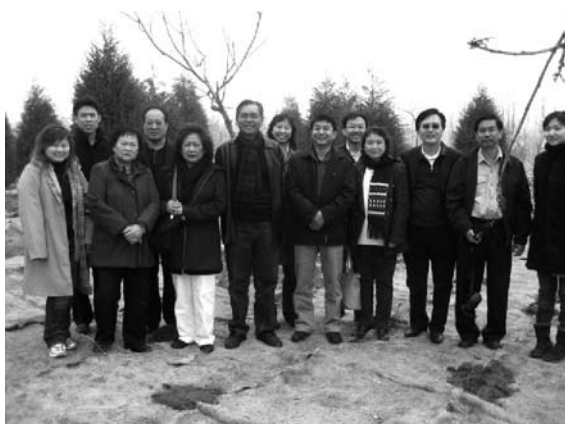
At the Ecomat project site.