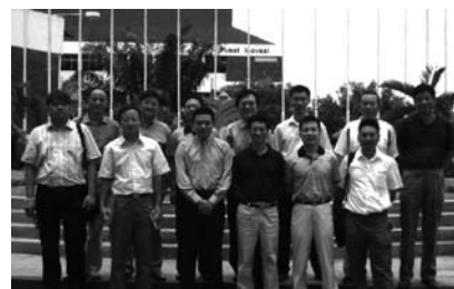
Figure 9. Participants of the Palm Discovery Tour.