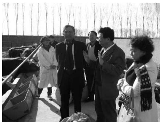
At the Daxing cattle feedlot site.