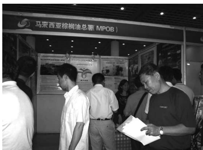
Figure 13. Shandong Enterprise-University-Research Institute Collaboration Exhibition & Talk, May 2008, Jinan.