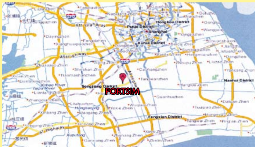
Figure 1. Map showing the location of PORTSIM.