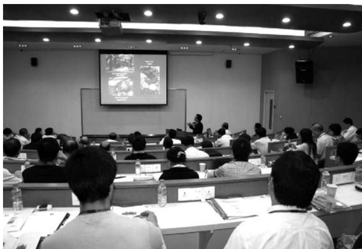
Figure 8. Rohm & Haas Biodiesel Seminar 2007, Shanghai.

• Palm Oil Food Uses (POFU) Workshop on Baking. PORTSIM organized the Palm Oil Food Uses (POFU) Workshop on Baking on 28