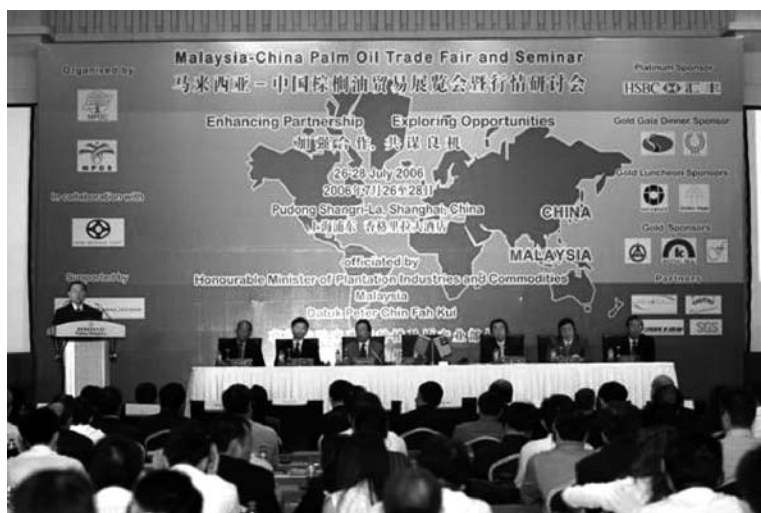
Figure 7. Opening ceremony of the Malaysia-China Palm Oil Trade Fair and Seminar 2006, Shanghai.

This Malaysia-China Palm Oil Trade Fair and Seminar has successfully enhanced the image of palm oil in China. At the same time, it provided market information on oils and fats industry to both domestic and foreign participants. The seminar and trade fair also highlighted the development of palm oil in China, and strengthened the networking between Malaysian and Chinese business communities. In addition, the seminar enhanced trade relationships as well as forged