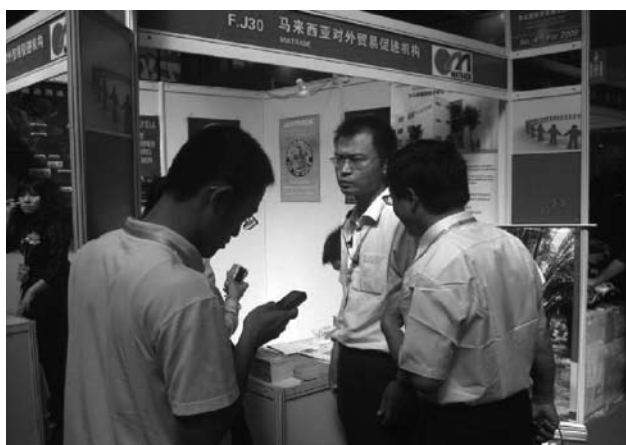
Figure 16. The 4 th China Jilin International Investment & Trade Expo, 2-6 September 2008, Changchun, Jilin Province.