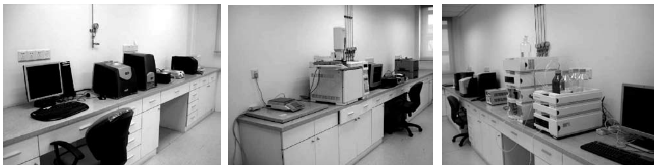
Figure 4. Analytical instruments.