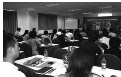
Figure 11. The Palm Oil Food Uses (POFU) Workshop 2007, September 2007, PORTSIM office.

September 2007 at PORTSIM (Figure 11). The workshop on baking was to introduce and promote the utilization of palm oil products in Chinese baked foods. It also aimed at creating awareness and understanding in palm oil and its versatile uses. It acted as a forum to create business opportunities between China and Malaysia. The Workshop was attended by 30 participants, and the following five papers were presented: