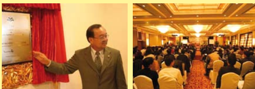
Figure 3. Official opening of PORTSIM and seminar.

2007. The main objectives of the RAC are to advise on the research programmes of PORTSIM, related activities of the oil palm/palm oil industry and any other matters related to the functions and activities of PORTSIM. The RAC was established to assist PORTSIM in achieving its objectives of enhancing the usage and applications of palm oil in China through its research programmes and activities. The first meeting of RAC was held from 29-30 March 2007 at PORTSIM during which the Committee evaluated new project proposals and approved five collaborative projects. The second RAC meeting was held from 13-14 March 2008 at PORTSIM office during which the Committee reviewed the progress of the five on-going projects.