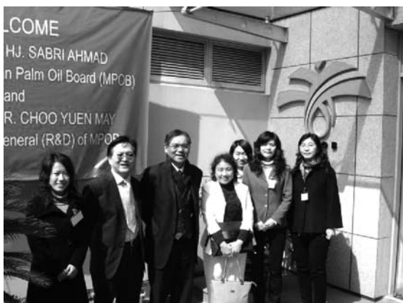
Dato' Sabri Ahmad and entourage at PORTSIM.