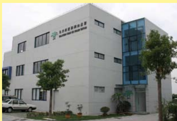
Figure 2. Palm Oil Research and Technical Service Institute of MPOB (PORTSIM) in Shanghai, P R China.