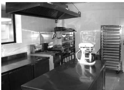
Figure 5. Kitchen facilities.

Frozen Dough will be published in the journal, China Oils and Fats .