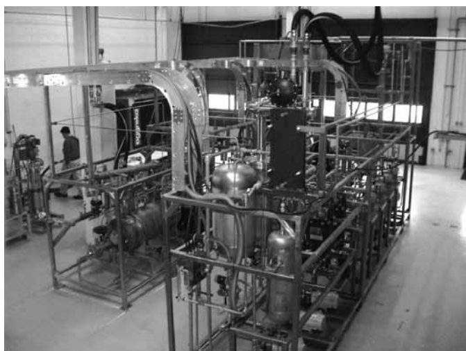
Figure 8. Supercritical fluid chromatography pilot plant.