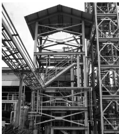
Figure 4. Reaction pilot plant.