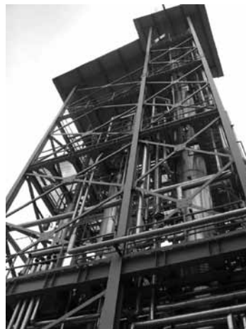
Figure 7. Fractional distillation pilot plant.