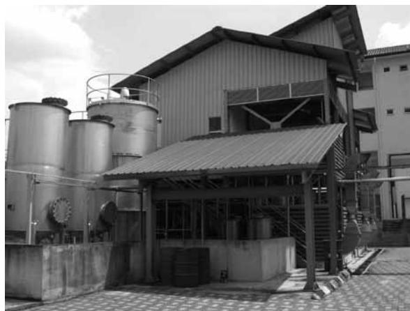
Figure 5. Dry and solvent fractionation pilot plant.