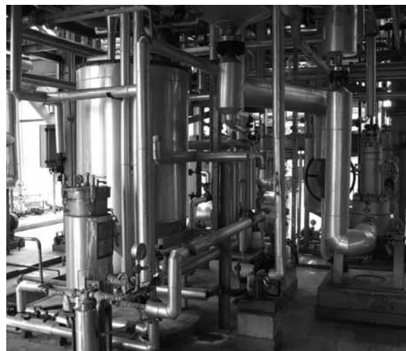
Figure 9. Hydrogenation pilot plant.