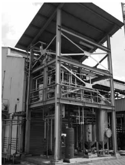
Figure 2. Pre-treatment pilot plant.