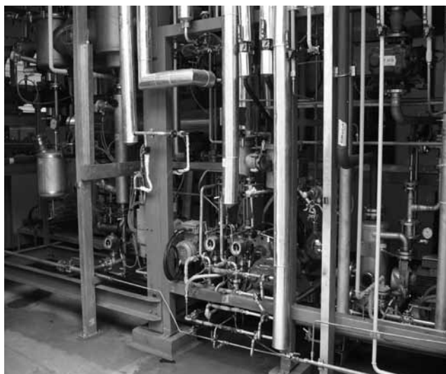
Figure 3. Short path distillation plant.