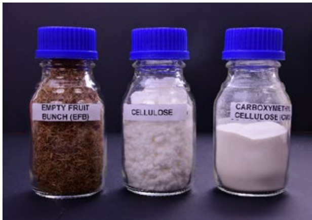
Figure 1. Carboxymethyl cellulose (CMC) from oil palm empty fruit bunch.

oil palm-based CMC is environmentally friendly, as it utilises byproducts from palm oil production, contributing to waste reduction and sustainability. Its bio-based nature and functional advantages position oil palm-derived CMC as a promising ingredient in the development of innovative and sustainable food formulations.