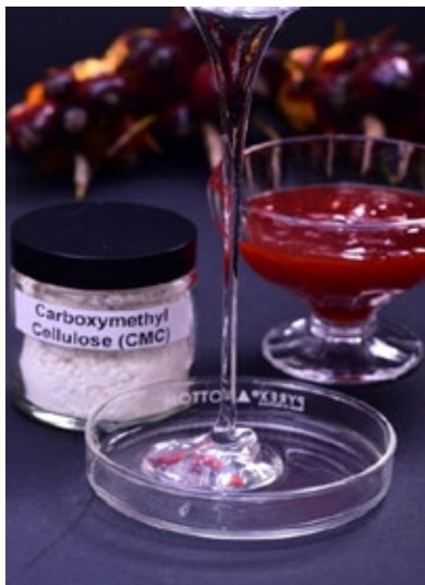
Figure 2. Carboxymethyl cellulose (CMC) from oil palm empty fruit bunch as thickening agent.

oil palm-based CMC is environmentally friendly, as it utilises byproducts from palm oil production, contributing to waste reduction and sustainability. Its bio-based nature and functional advantages position oil palm-derived CMC as a promising ingredient in the development of innovative and sustainable food formulations.